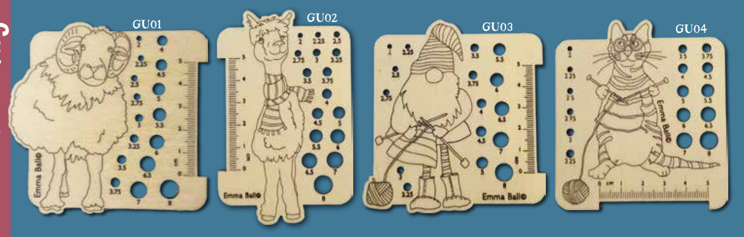
New for 2024 are these plywood needle gauges- all measuring approx 80mm high and include a small ruler!